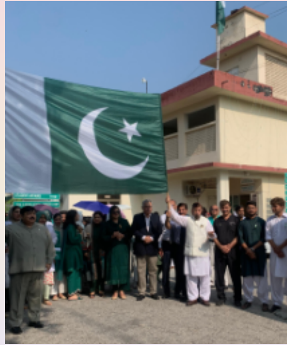
Edit with WPS Office 14th Aug Parade