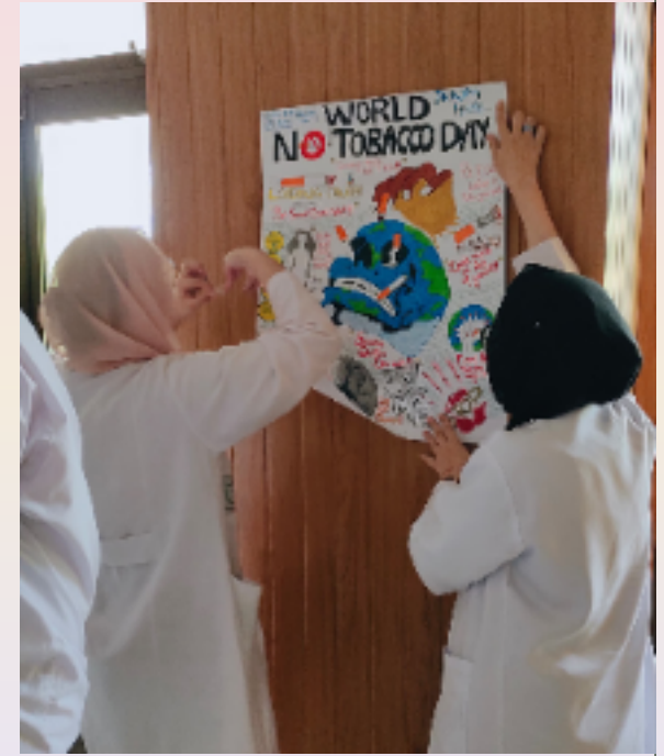
NO Tobacco Day